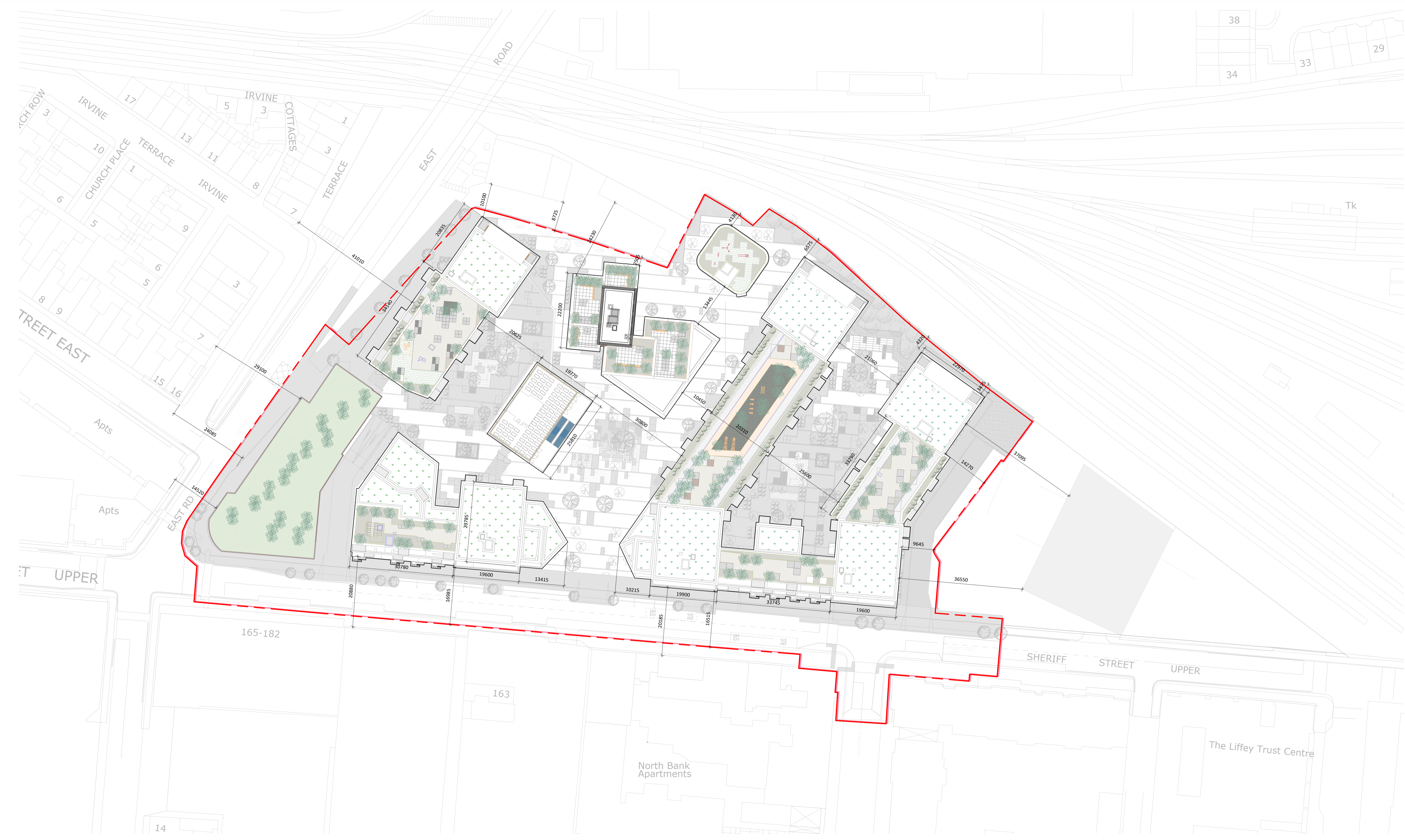
Proposed Site Layout